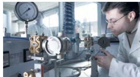
In-house laboratory testing