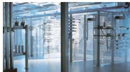
In-house test area simulating the most diverse working conditions