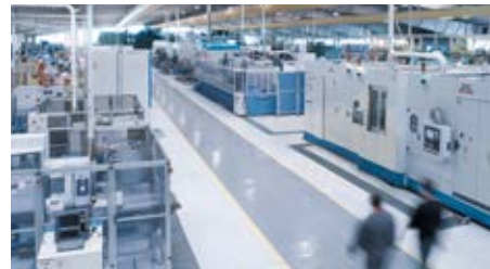
Palpenazze production facility - Italy

the procedures put in place on a global level. The Camozzi Quality Department is responsible for adhering to the quality and environmental legislations, as certified according to the ISO 9001 and ISO 14001 international standards. We aim to ensure total quality throughout all areas of activity and strive to continuously improve.